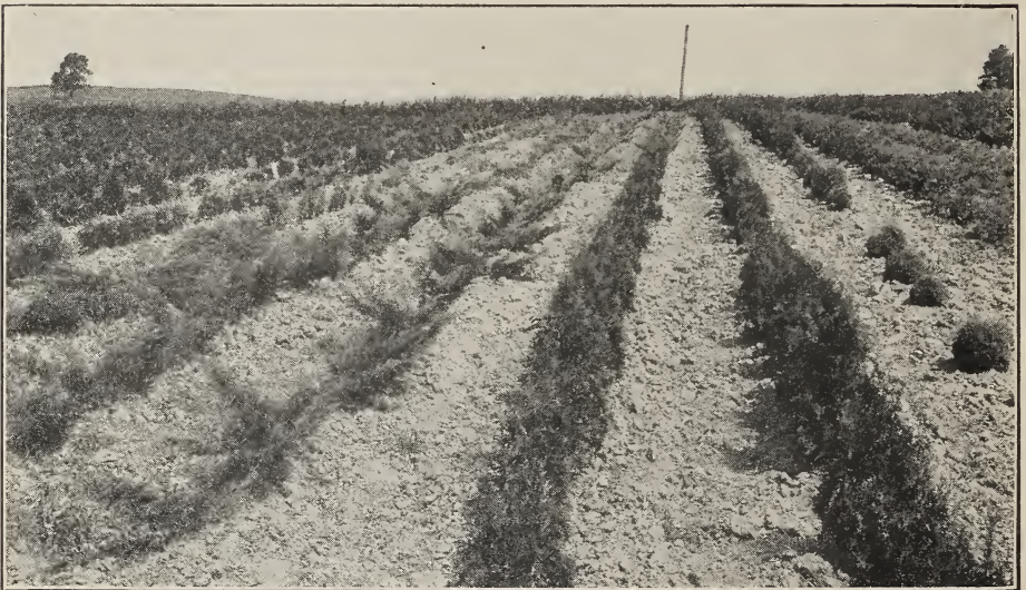
This is a block of Evergreens showing Arbor Vitae, Pyramidalis and Junipers Sabina, Etc. Also note other assorted varieties of Evergreens to right and left, all of which are nice popular size for immediate effect. Photographed July 10, 1924.

We call your attention to our Evergreens and low prices. August 25th to September 25th is the proper time to transplant all evergreens. We dig all Evergreen with a good ball of earth and then burlap them.